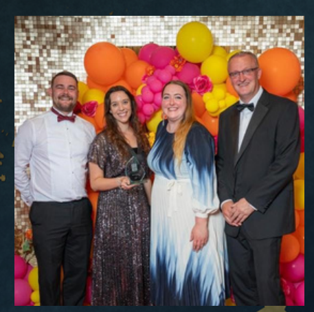
NBA Awards 2023

We've been the proud recipients of numerous awards for consistently brilliant customer service. Come and experience it for yourself!