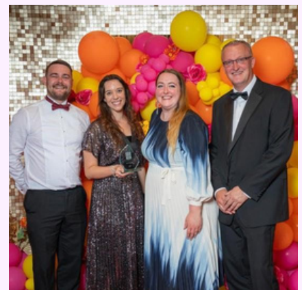
NBA Awards 2023